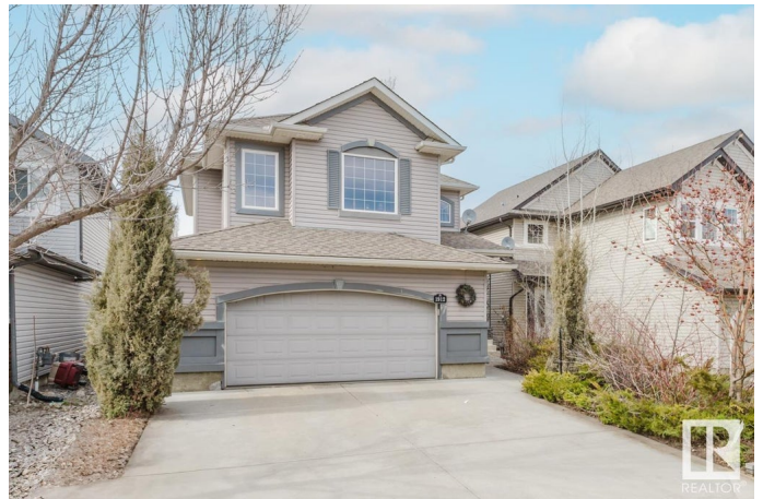
1912 121 St SW, Edmonton, AB