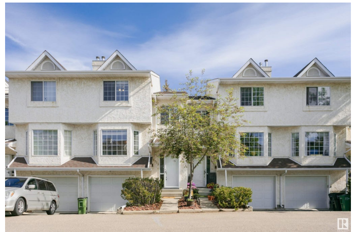
9775 176 St NW, Edmonton, AB