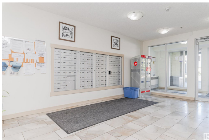
223-5816 Mullen Pl NW, Edmonton, AB