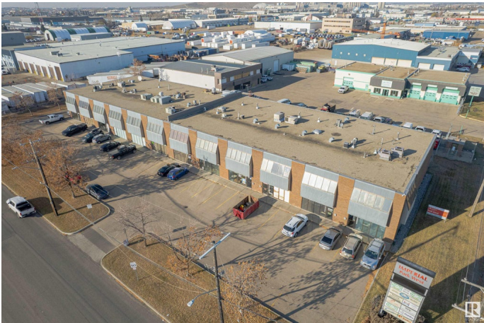
15612 116 Ave NW, Edmonton, AB

Main Floor Exterior Area 1885.08 sq ft Interior Area 1569.02 sq ft